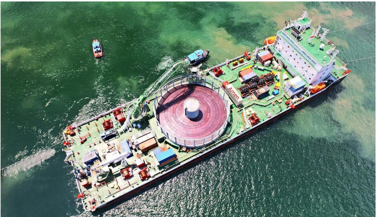
CABLE LAYING VESSEL